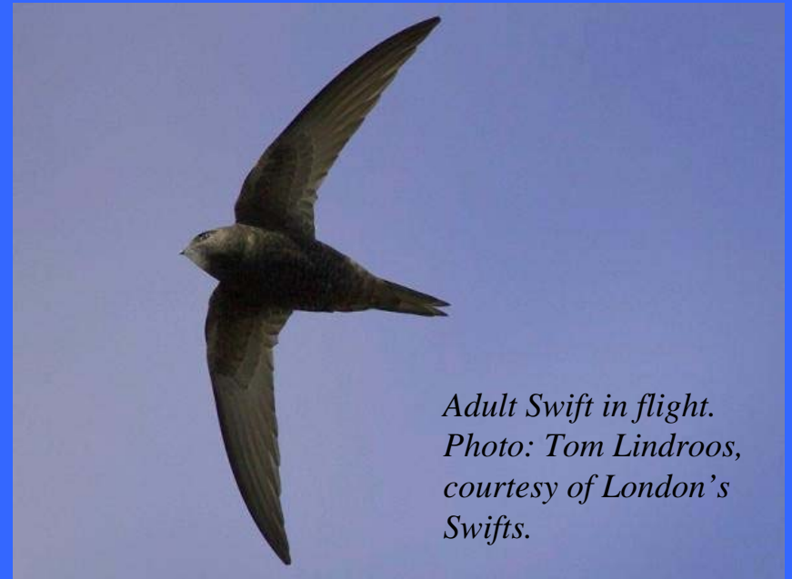
Adult Swift in flight.